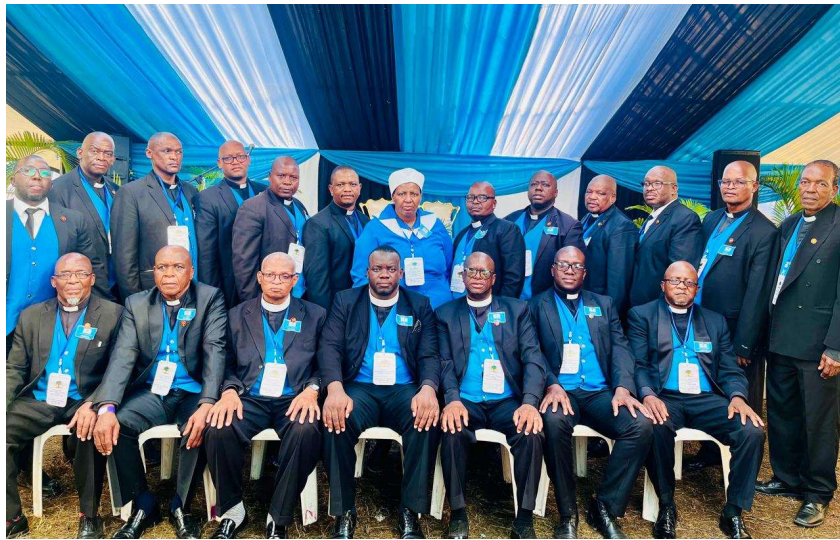
The Deputy ICO (front center), Regional Overseer-South (centre- left), C/Overseer Eswatini (centre-right) & the BOT of South of Limpopo

A multitude of the AFC faithful from all corners of South Africa and the neighboring Countries in the South of Limpopo Region gathered in the city of Durban, South Africa to celebrate the death and resurrection of our Lord Jesus Christ during a three-day glorious Passover Conference from Friday, April 18 to Sunday, April 20, 2025, hosted in the Kwazulu-Natal Province also designated as a District as per the AFC Zoning.