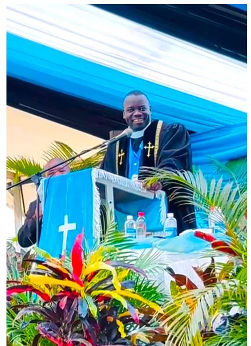
Deputy ICO, Official Opening